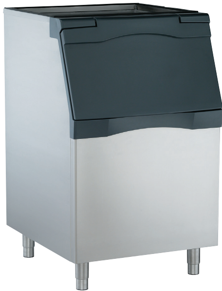
B530S shown with optional KLP8S legs