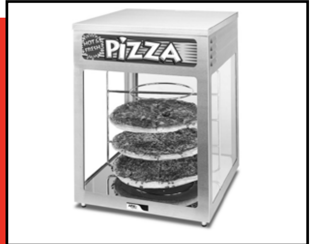
HDC-4 Heated Display Cabinet