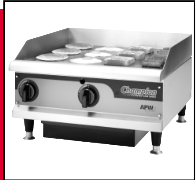
COUNTERTOP ELECTRIC GRIDDLE